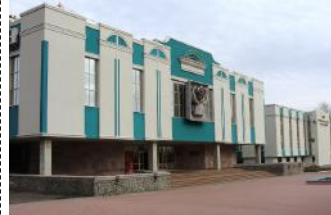
Mordovian Erzia Museum of Visual Arts is a museum in the Saransk city in Mordovian Republic. Mordovian Erzia Museum of Visual Arts holds the world's largest collection of more than 200 works done by the famous sculptor of the 20th century Stepan Dmitrievich Erzia. The museum also contains collection of works of Mordovian folk artists, such as F. Sychkov, and I. Makarov.

⌚ Open hours: Thu: 9:00-18:00 Fri: 9:00-18:00 Tue: 9:00-18:00 Wed: 9:00-18:00 Thu: 11:00-20:00