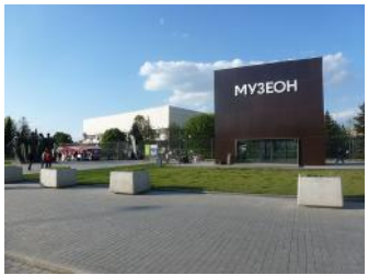
Muzeon Park of Arts (formerly the Park of the Fallen Heroes or Fallen Monument Park) is a park outside the Krymsky Val building in Moscow shared by the modern art division of Tretyakov Gallery and Central House of Artists. It is located between the Park Kultury and the Oktyabrskaya underground stations. It is the largest open-air sculpture museum in Russia, with more than 700 artworks currently on display and another 200 in storage. The origins of this expatriate English name are unknown: in

Russian, the park is either simply named Sculpture Park of the Central House of Artists (Russian: Парк скульптуры ЦДХ) or referred to by its legal title, Muzeon Park of Arts (Russian: Парк Искусств, Park Iskustvy).