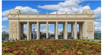
Gorky Central Park of Culture and Leisure (Russian: Центральный парк культуры и отдыха (ЦПКиО) имени Горького, tr. Tsentralny park kul'tury i otdykha imeni Gorkogo, IPA: [tsɪn 'tralʲnʲɪj 'park kulʲ'turi i 'oddɨxə 'imɨnɪ 'gorkova]) is a central park in Moscow, named after Maxim Gorky.