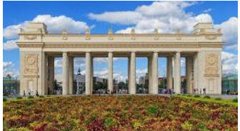
Gorky Central Park of Culture and Leisure (Russian: Центральный парк культуры и отдыха (ЦПКиО) имени Горького, tr. Tsentralny park kul'tury i otdykha imeni Gorkogo, IPA: [tsɪn 'tralʲnʲɪj 'park kulʲ'turi i 'oddɪxə 'imɨnɪ 'gorkova]) is a central park in Moscow, named after Maxim Gorky.