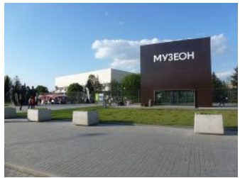
Muzeon Park of Arts (formerly the Park of the Fallen Heroes or Fallen Monument Park) is a park outside the Krymsky Val building in Moscow shared by the modern art division of Tretyakov Gallery and Central House of Artists. It is located between the Park Kultury and the Oktyabrskaya underground stations. It is the largest open-air sculpture museum in Russia, with more than 700 artworks currently on display and another 200 in storage. The origins of this expatriate English name are unknown: in

Russian, the park is either simply named Sculpture Park of the Central House of Artists (Russian: Парк скульптуры ЦДХ) or referred to by its legal title, Muzeon Park of Arts (Russian: Парк Искусств, Park Iskustvy).