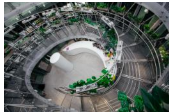
Zaryadye Park (Russian: Парк «Зарядье») is a landscape urban park located adjacent to Red Square in Moscow, Russia on a former Rossiya

Hotel site. Zaryadye Park is the first public park built in Moscow for over 50 years, the last being the Soviet Friendship Park, built for the 1957 Festival of Youth and Students. The park was inaugurated on September 9, 2017, with the participation of President Vladimir Putin and Moscow Mayor Sergey Sobyanin.